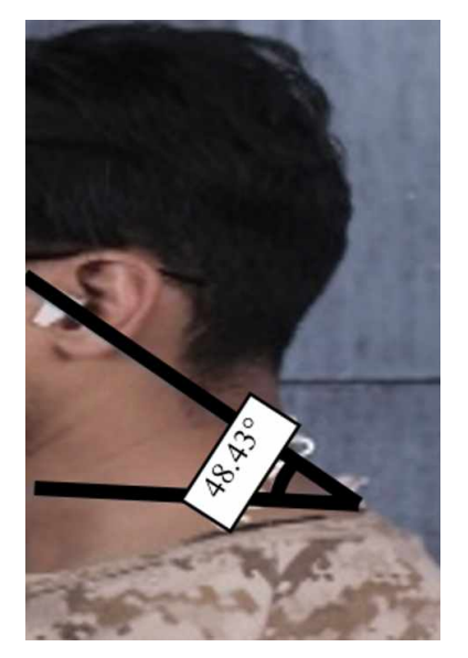
Figure 2: Craniovertebral angle showing forward head posture