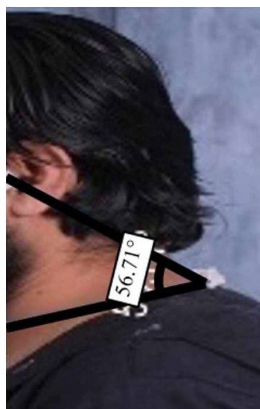
Figure 1: Normal angle between C7 and tragus

Data was analyzed using SPSS 21. Descriptive data was calculated in the form of mean and standard deviation. The relation between different variables was assessed by using Pearson correlation.